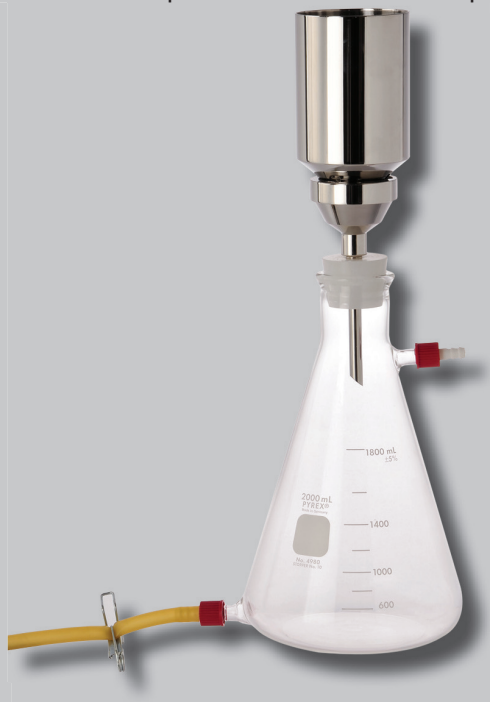
VF11 - silicone stopper Ø47mm, 500ml