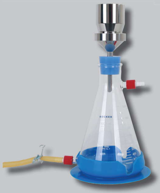
VF2 - silicone stopper Ø47mm, 100ml